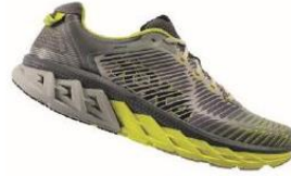
ARAHI MENS: HEEL 29MM | FOREFOOT 24MM WOMEN: HEEL 28MM | FOREFOOT 23MM DROP: 5MM WEIGHT: MENS 265G | WOMEN 215G TECH: J-FRAME