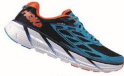
CLIFTON 3 MENS: HEEL 29MM | FOREFOOT 24MM WOMEN: HEEL 28MM | FOREFOOT 23MM DROP: 5MM WEIGHT: MENS 235G | WOMEN 203G TECH: FULL EVA MIDSOLE