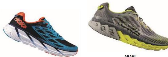
CLIFTON 3 MENS: HEEL 29MM | FOREFOOT 24MM WOMEN: HEEL 28MM | FOREFOOT 23MM DROP: 5MM WEIGHT: MENS 235G | WOMEN 203G TECH: FULL EVA MIDSOLE

After wearing and testing them we will report back.